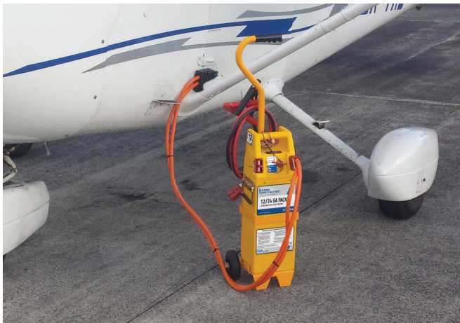
12/24V GA Pack: powering a Cessna 172R

** Peak amps is a theoretical calculation of the instantaneous current from a momentary dead short across the battery terminals. It is not representative of the power delivered at the aircraft plug which is significantly less, due to cable losses and other factors. It is a figure of no useful value to the operator and is shown only for comparative purposes.