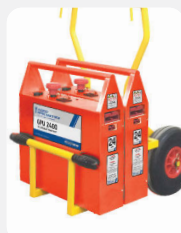
Coolspool 2400 Twin