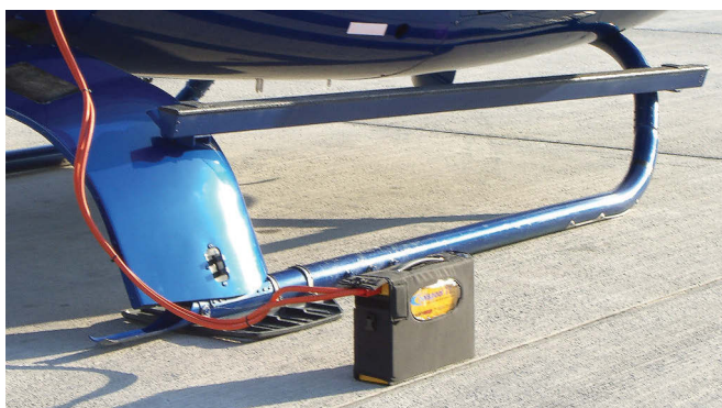
Coolspool 17: EC130 preflight and start