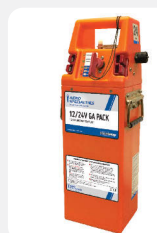
12/24 GA Pack