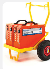
Coolspool 29 Twin