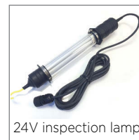
24V inspection lamp