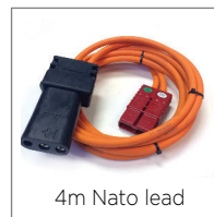
4m Nato lead