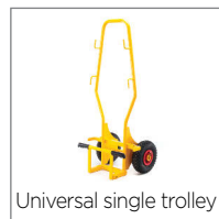
Universal single trolley