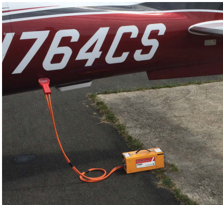
PS50: in operation on a Cessna TTx